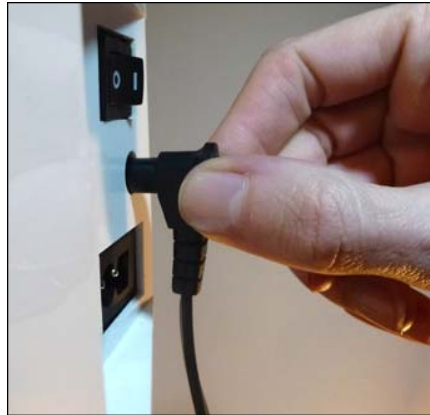
Step 2 – Push pin into socket