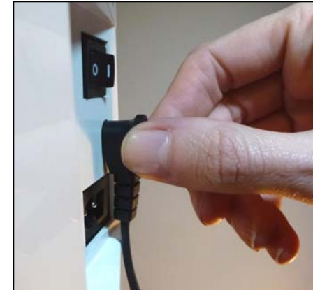
Step 3 – Push until plug is flush with machine

The foot control plug must be pushed into the sewing machine fully for the foot control to work properly. (See Step 3.)